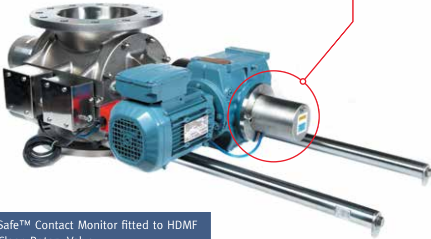
RotaSafe™ Contact Monitor fitted to HDMF Fast Clean Rotary Valve