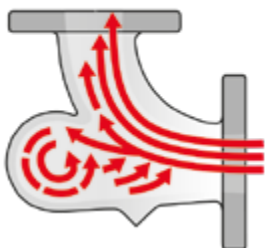
With Gericke Elbow